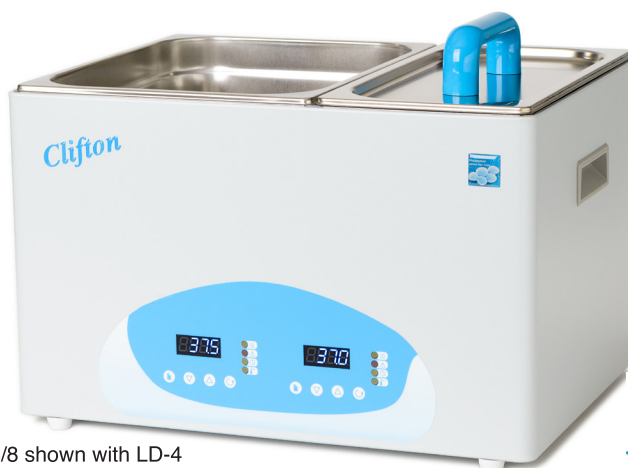
NE2D-4/8 shown with LD-4