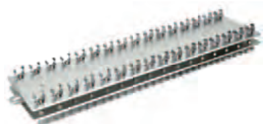
VM80-A Tube Holder Frame: 1.5ml Centrifuge x 64