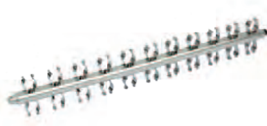
VM80-B Tube Holder Frame: 15ml Sharp Bottom Tube x 22