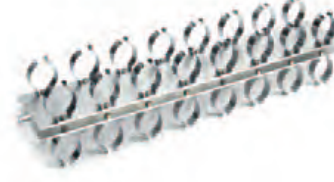
VM80-C Tube Holder Frame: 50ml Sharp Bottom Tube x 16