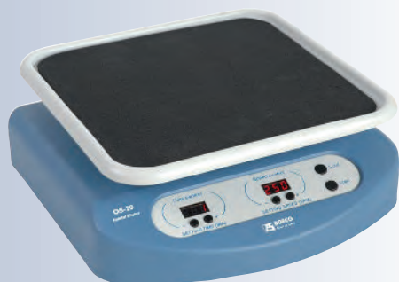
OS-20 ILLUSTRATED WITH PP-4 PLATFORM