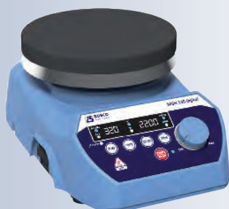
MSH 140 DIGITAL